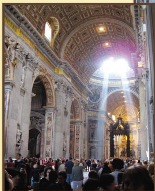
Far left: St. Peter's awe-inspiring vaulted ceiling draws attention heavenward.