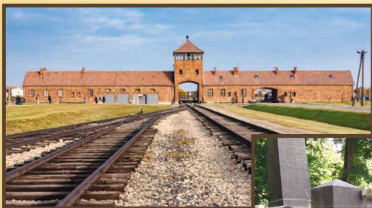
Above: Auschwitz-Birkenau, the final destination for so many during WWII. Right: A final resting place for Jews in Krakow, Poland.

“By the consecration of the bread and wine there takes place a change of the whole substance of the bread into the substance of the body of Christ our Lord and of the whole substance of the wine into the substance of his blood. This change the Holy Catholic Church has fittingly and properly called transubstantiation.” 7