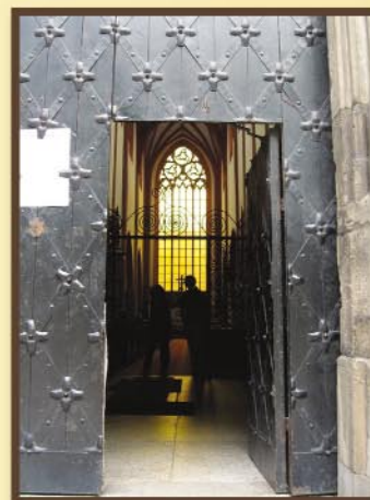
Left: Worshipping at Mass.