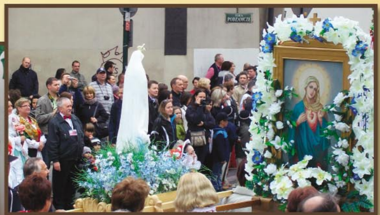
Left: At a roadside shrine, Mary overshadows Jesus. Above: Venerating Mary in Krakow.