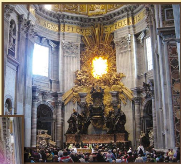
Above: Offering the sacrifice of the Mass in St. Peter's.