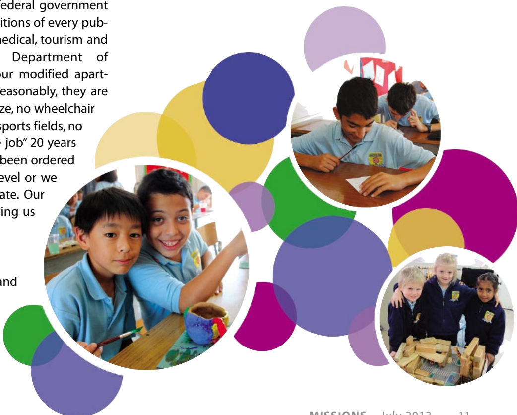
Opposite page (L-R): Girls from Jordan and Philippines; Graduation 2011. Below (clockwise from left): Art lesson—boys from Korea and Costa Rica; French vocabulary quiz; Kindergarten friends.